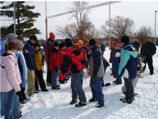
Students involved in this great project are dressed for adventures in learning!

What activities are completed during Carolyn's unit? Students study about the Iditarod using the internet sites and complete activities. They also read Gary Paulsen's book, Woodson .