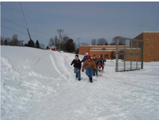
Wisconsin's snow provides a great trail for the race, creating the perfect Wisconsin racing adventure!