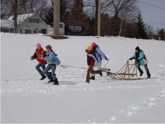
Running in the Idita-Luck takes team work!