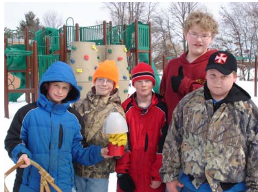
Red Lantern Winners!