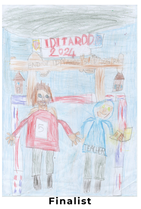
Rowan - Age 8