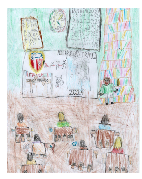
Finalist Arley - Age 6