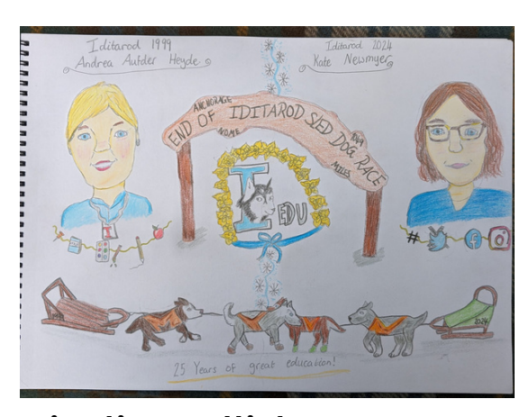
Finalist - Allish - Age 13