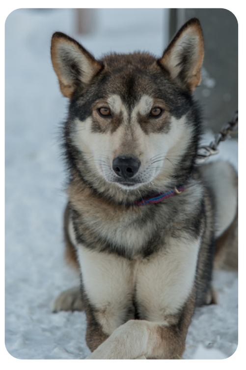
click on photos to enlarge