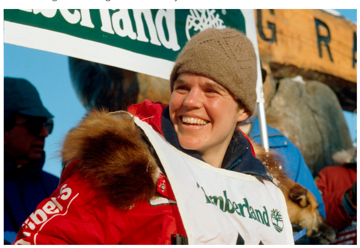
Click photo for a larger image.