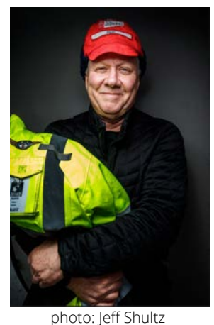
Faces of Iditarod