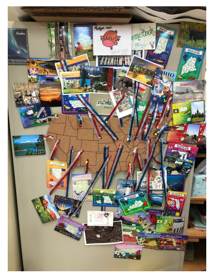
Dawn Serigne's Arkansas Classroom