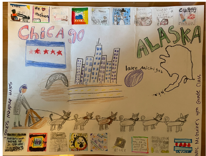
We will announce plans for next year's Trail Mail Art Contest and Educational Trail Mail early next fall. Keep your eye on the newsletter, EDU website and Facebook Page for details!