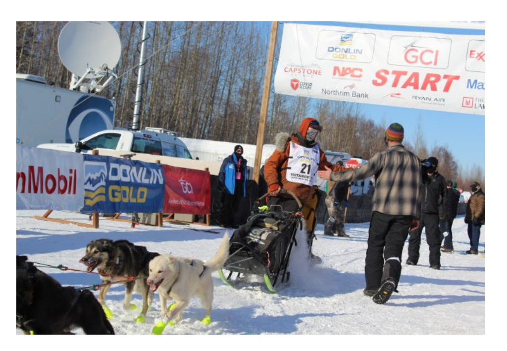
Brent Sass at the Starting Line of the 2021 Iditarod