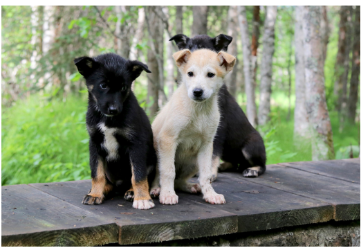
Spring is for Puppies and Free Runs! Learn More on Page 6.

It's almost been 50 years of mushing across 1,049 miles of wilderness Alaska. I'm glad you came along for the ride! Until next time, Gypsy