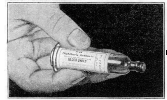
A Magic Weapon Against Plague This little bottle contains 10,000 units of diphtheria antitoxins, sufficient for one treatment. Thirty times this amount was carried in the dramatic dash over the snow to Nome, where 27 persons lay sick of the dread disease