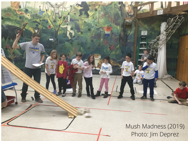
Mush Madness (2019)

As the name alludes to, we model this STEM project after the March Madness basketball tournament. So each team is put into a random bracket-style tournament until the winner is crowned! The team names are always very creative and the sled designs are incredibly different. I hope your classes have fun with this! Come back on the 15th for the full lesson plans.