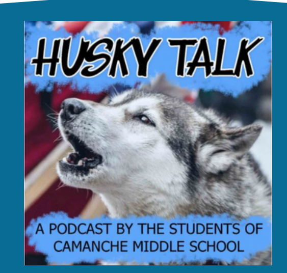
Husky Talk is back! Listen to Season 7 Episode 1 with guest Shannon Noonan