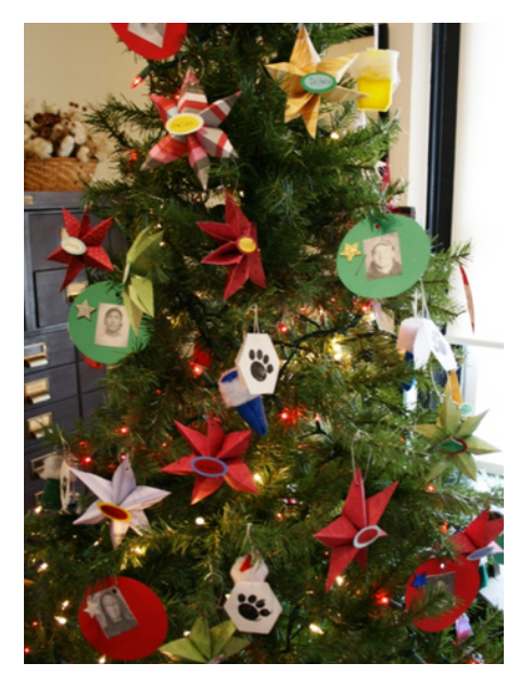
Make an Iditarod themed Christmas Tree!