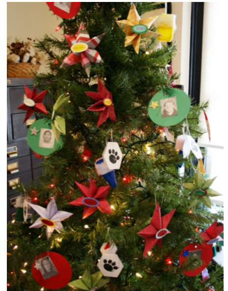
Make an Iditarod themed Christmas Tree!