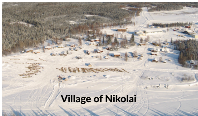
Village of Nikolai

route system in Alaska usable only during the winter, extending 1100 miles (1770 kilometers) from Seward to Nome, and site of the annual Iditarod Trail Sled Dog Race