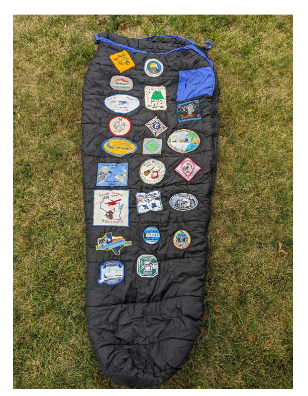
Teacher on the Trail Sleeping Bag

Classroom Connections: Personal Patch Making Since many of us are starting the year virtually or in some "hybrid" model, making connections to classmates and finding activities to get to know each other is more challenging. The patches found on the Teacher sleeping bag and other patches seen all over Iditarod each have a special meaning and significance. In this lesson students will create a patch that represents themselves which will be drawn and explained to the class. Check out this lesson on the 10th!