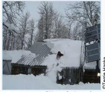
Snow avalanching off Yentna Station roof.

then landing in the piles of soft snow below the eves. Maybe you shouldn't try this at home especially with asphalt shingles.