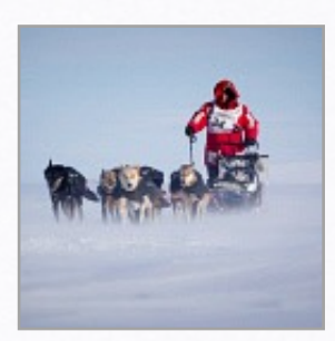
Dallas 8 Miles From Finish