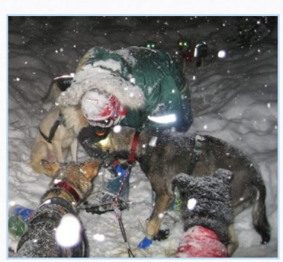
Abby Brooks putting booties on before leaving Yent-na Station Checkpoint.

These young mushers are very skilled at dog care.